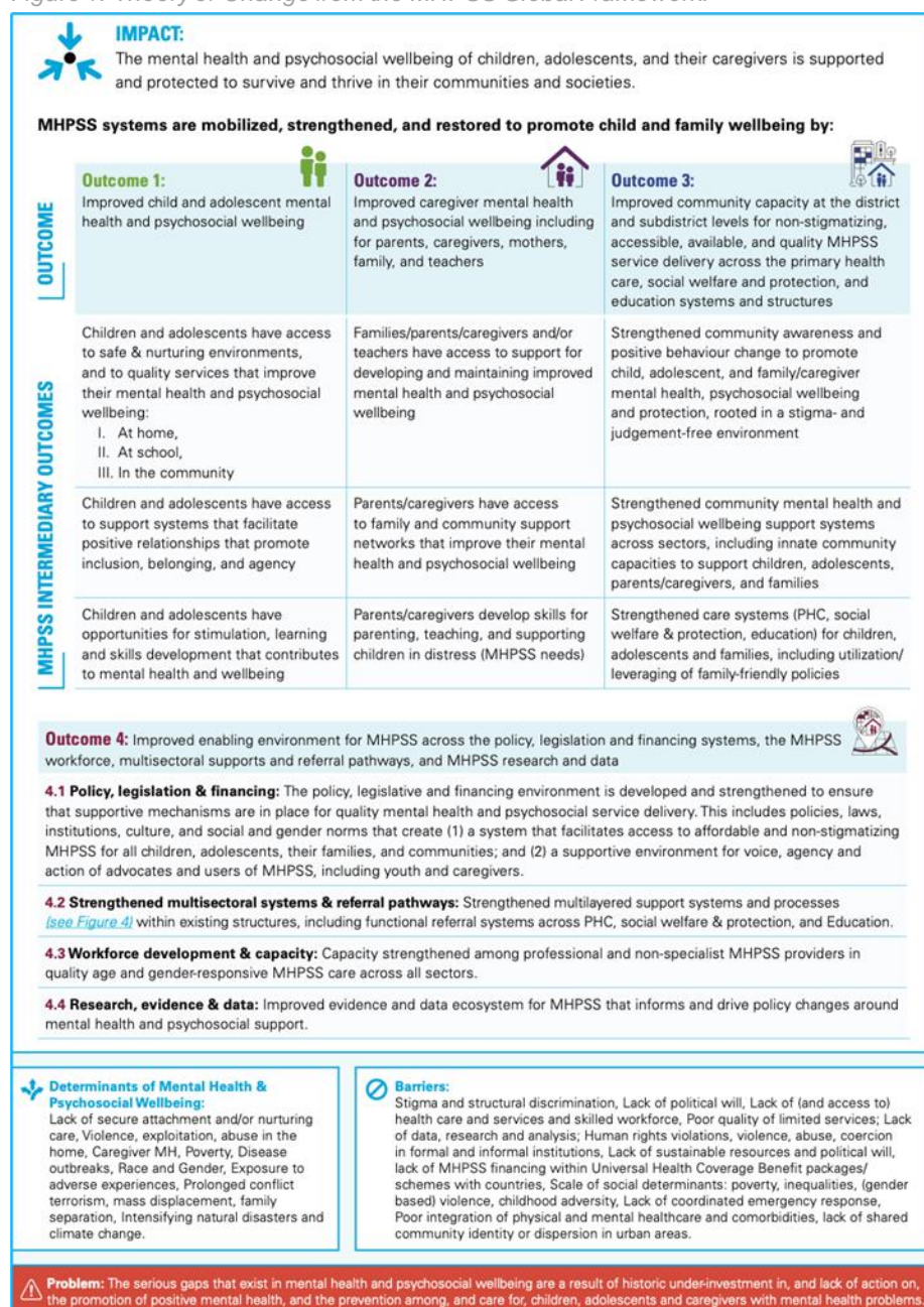
Figure 1: Theory of Change from the MHPSS Global Framework.

The Evaluation Office of UNICEF has elaborated an evaluative baseline of UNICEF programming on MHPSS from 2018-2021, confirming the strategic shift of UNICEF in MHPSS programming, the scaling up of its investments and the significant institutional strides to elevate the programme to a core multi-sectoral approach to MHPSS.